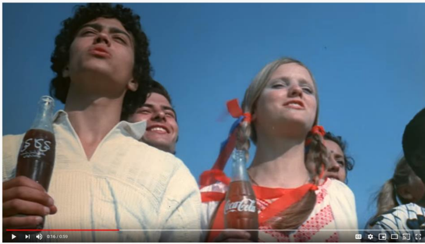
Coca-Cola, 1971 - 'Hilltop' | 'I'd like to buy the world a Coke'